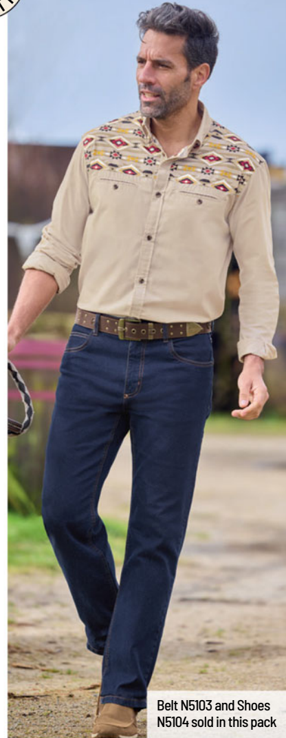
Belt N5103 and Shoes N5104 sold in this pack